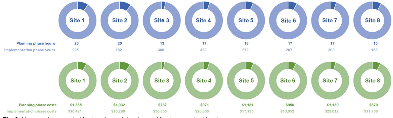
Fig. 2 Hours and costs of facilitation phases (planning and implementation) by site